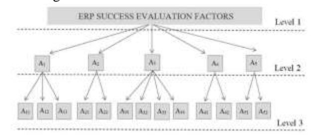
Fig. 2 AHP Model of ERP Success Evaluation Factors

This AHP model consists of 3 level. First level is objective function, which is an ERP success factor. Second level contains 5 factors as seen on Table 3, Each factor contains some subfactors on third level, with the total of whole subfactors is 13 as seen on Table 4. Figure 2. shows the AHP model. i