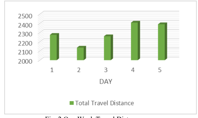
Fig. 2 One Week Travel Distance

Based on the Fig 1 about factors causing delivery delay, the most influential factor is delay in departure. It is because PT. XYZ don't have fixed schedule of delivery and they miscalculate the departure time because of improper route determination that also leads to longer travel distance. Route determination is left entirely to driver operator therefore there's no proper calculation that can optimize the distribution processes. They also spent a lot of time in goods unloading activity because operators have to move the milk from the vehicle into customer's refrigerator and put each cup one by one to stack the milk neatly inside the refrigerator.